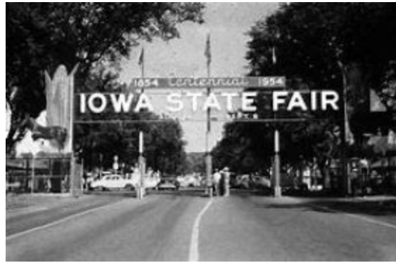
Above: 1954 entry gate. Center: 1950s Grand Concourse. Below: Late 1940s Varied Industries Building.